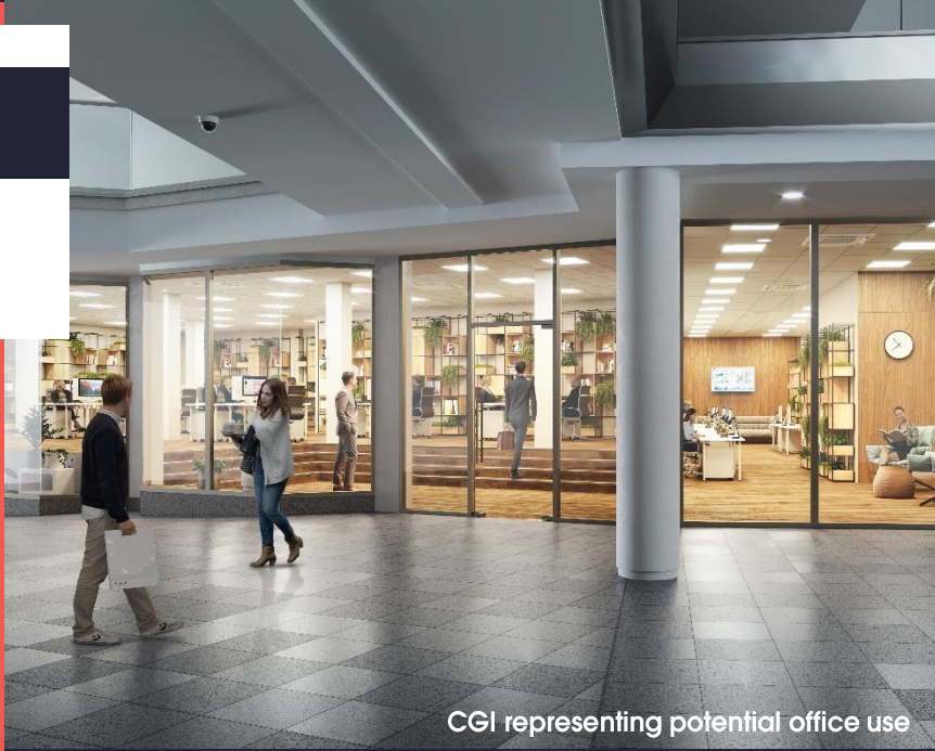
CGI representing potential office use

The Merrion Centre is at the heart of the Arena Quarter directly opposite the first direct Arena which can be accessed through the centre.